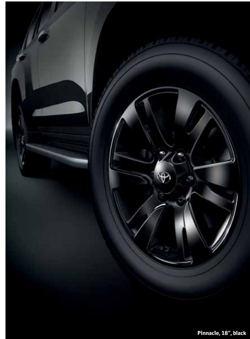
Pinnacle, 18", black

Wheel locks The rounded profile and unique coded key maximise alloy wheel anti-theft security. Made of hardened steel and with a chrome finish to visually complement your existing wheel nuts.