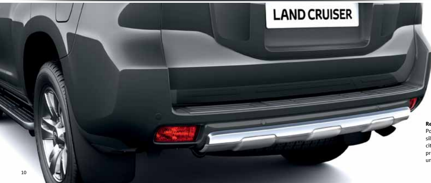
Rear underrun Powerful off-road design in a silver finish for that look of city style along with protection for the rear under-body and bumper.