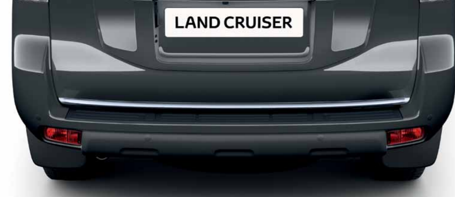
Rear lower trunk garnish A dash of chrome along the lower trunk edge to highlight your Land Cruiser's distinctive rear contours.