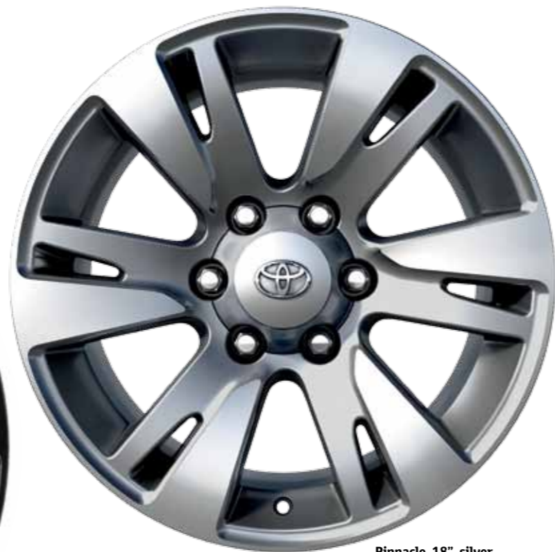
Pinnacle, 18", silver