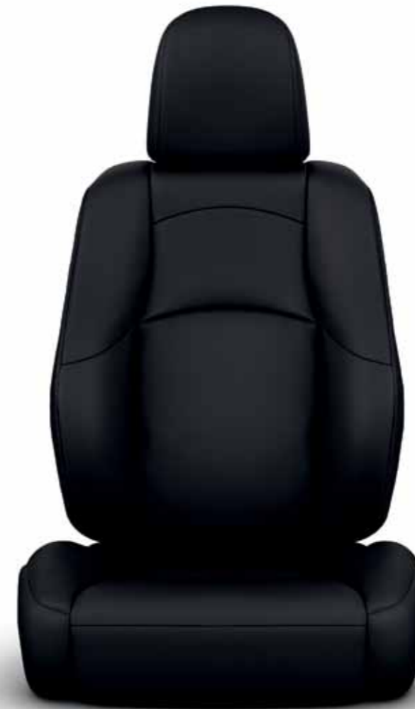
Black leather High quality black leather with matching black stitching.

Toyota seats are made with top quality leather to give you the ideal combination of style and practicality. Leather maintains its shape and prestige appearance year after year with minimal maintenance. Also, being a natural material, it 'breathes' and so increases passenger comfort in hot weather and on long journeys.