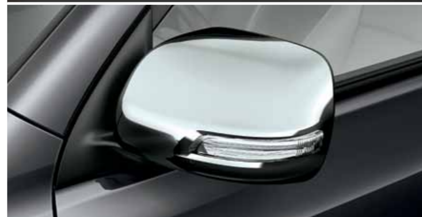
Mirror covers Carefully shaped for a secure fit around the indicator light and with a deep chrome finish to emphasise your car's sculptural mirror design.