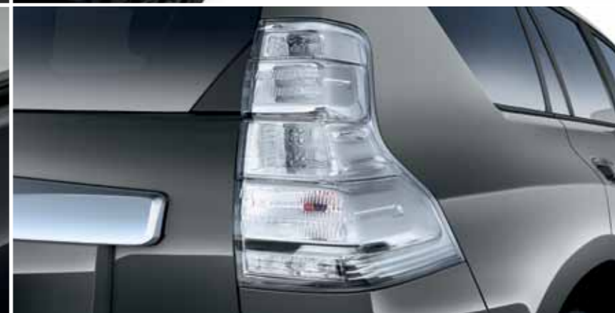
Rear combination lights Designed as an alternative to your car's existing rear light cluster. The look is refined, stylish and ultra-modern.