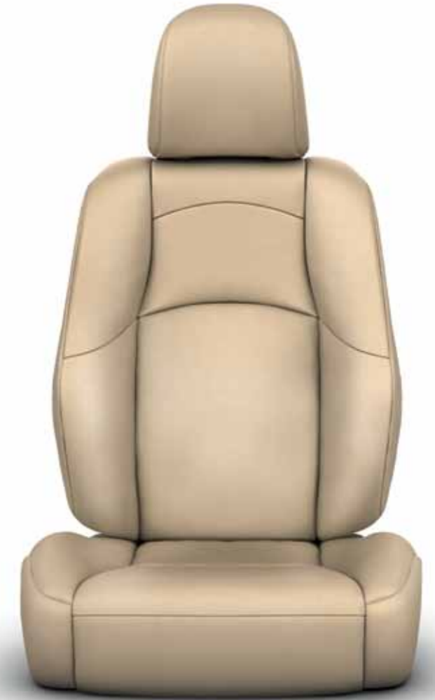
Beige leather Light stone beige leather with matching beige stitching.