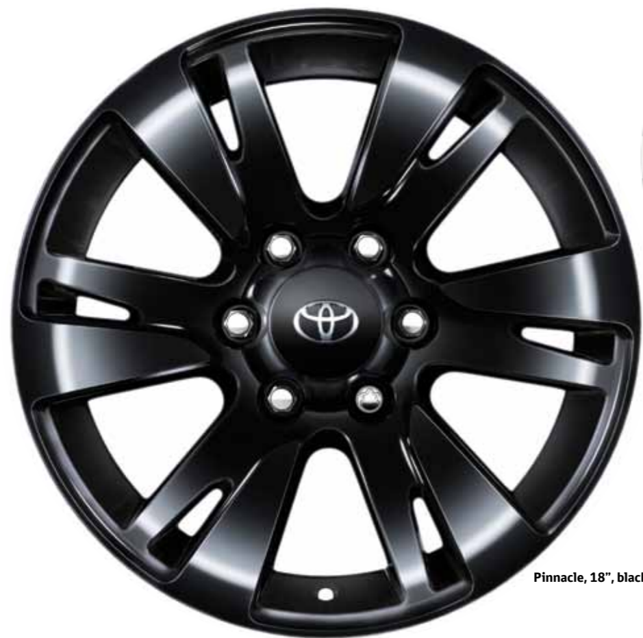
Pinnacle, 18", black

Style is personal. It's about adding extra touches of individuality. Toyota accessories give you that freedom. With choices ranging from alloy wheels to a rear skirt and chrome garnishes you can create a look for the way you like to be.