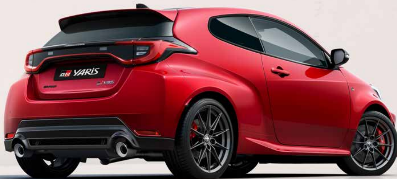
GR Yaris colour choices